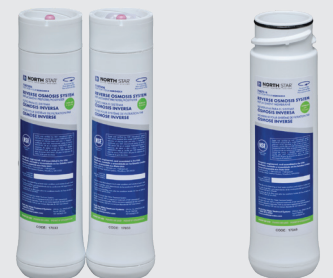
Pre & Post Filter NSROF