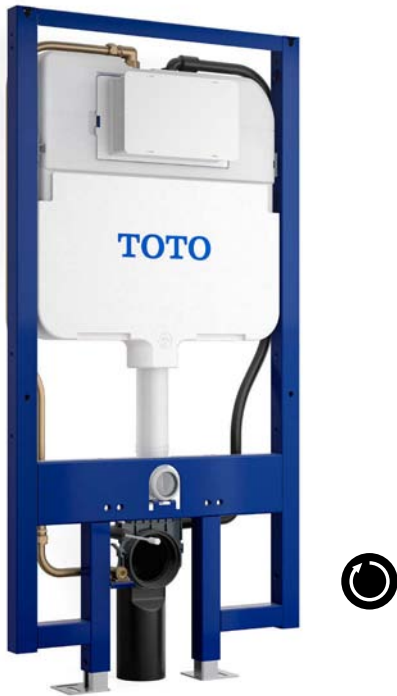
IN-WALL TANK WT175MA