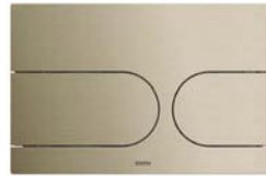
NICKEL PUSH PLATE YT990#N