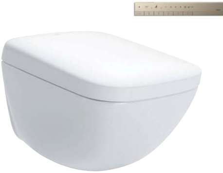
NEOREST WX2 CWT9548CEMFX#01

TOTO's new NEOREST WX2 and WX1 Wall-Hung models blend cutting-edge technology with a sleek space-saving design, offering unparalleled comfort, hygiene, and sustainability for a truly sophisticated bathroom experience.